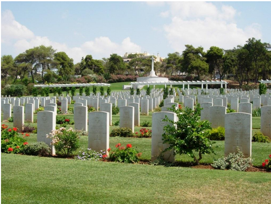
Phaleron War Cemetery, near Athens